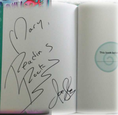
Huga Tuga in the Seashell Mystery Picture storybook - 32 page (ages 3-7)