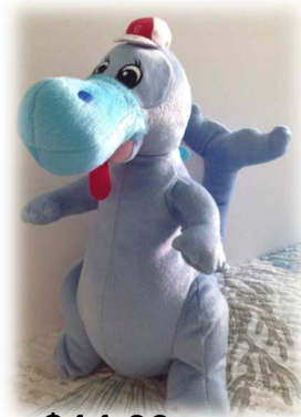
$14.00 13" Plush Toy